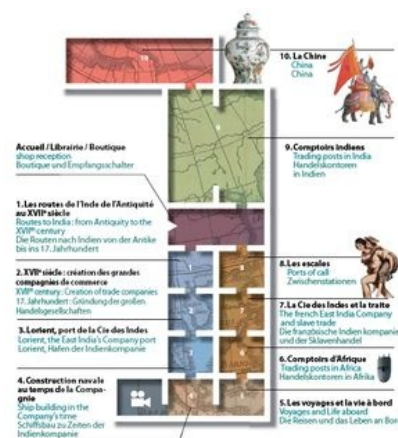
What to see in the museum