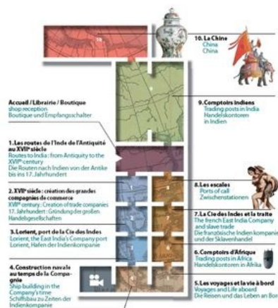
What to see in the museum